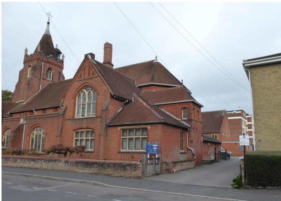
View into the site from Alma Road – halls roof in the distance