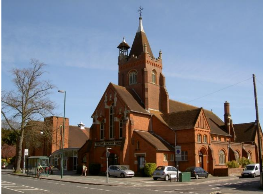
Key view of the church from The Avenue

PLANNING APPLICATION REFERENCE 18/02007/FUL